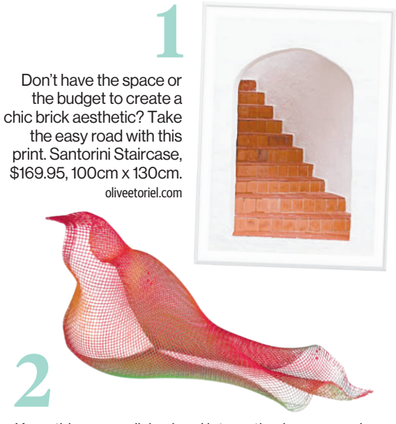
Keep things unpolished and interesting in your modern home with an artwork made of orange and green mesh wire. No two are alike. Bird sculpture, $124.56. etsy.com/au

Raw materials and relics give this place a sense of awe