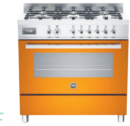
Orange is a bright and easy colour to include in a raw and rustic-inspired home. Bertazzoni Professional Series 90cm cooker, $8999. designerappliances.com.au

The industrial theme continues with a railway clock that is a nod to the unrefined eras of the past. It would be great to land an original. Double sided clock, $274.95. ohclocks.com.au