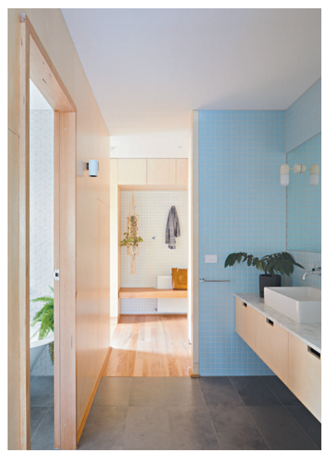
Orange is a highlight hue against muted blues and natural timbers