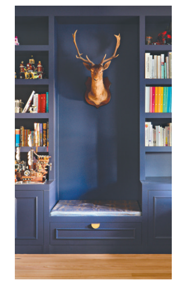
The study is a standout feature of the home

"I have no idea how much this house cost to build, I just know what my mortgage is," he says. "I can't quantify the amount of time and weekends I spent here working or add up the fixtures and the fittings." One thing he does know however. "It works for us."